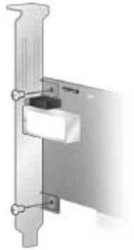
Figure 1: Removing the Bracket