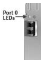
Figure 3: LEDs

Green and yellow LEDs can be seen through openings in the HBA's mounting bracket. Green indicates firmware operation and yellow signifies port activity. Each port has a corresponding set of green and yellow LEDs.